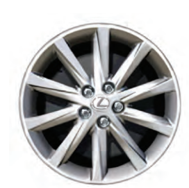
16-inch 10-spoke alloy wheel STANDARD