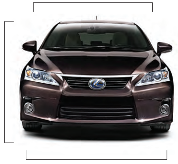
WIDTH 1,765 mm/69.5 in

HEADROOM SHOULDER ROOM front/rear front/rear 1,370/1,335 mm - 53.9/52.6 in 960/940 mm - 37.8/37.0 in