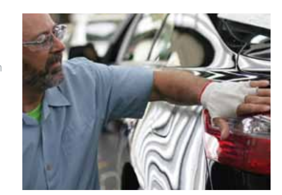
THE HUMAN TOUCH. As impressive as the machinery is, the achievement of perfect fit and finish is also the result of continuous human touch for every step of the way.

PROCESS is one that is constantly evolving. With our "Just-In-Time" practice, the goal is to make certain that during the manufacturing process, only what is needed gets produced. The result is twofold: because there's no excess supply, any issues are exposed and promptly resolved to ensure that everything off of the Toyota assembly line is of exceptional quality.