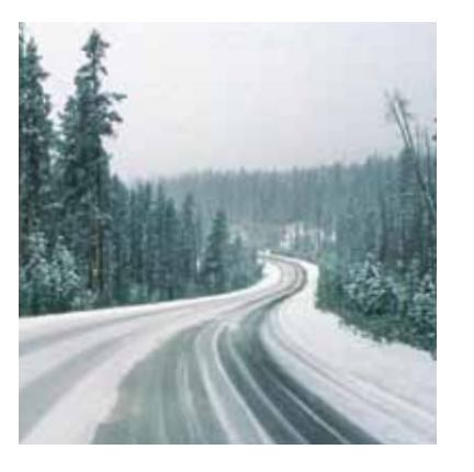
For more information visit toyota.ca