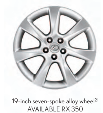
19-inch seven-spoke alloy wheel 21 AVAILABLE RX 350