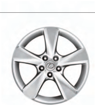
18-inch five-spoke alloy wheel 21 STANDARD RX 350 AND RX 450h