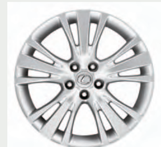
19-inch split-five-spoke alloy wheel 21 AVAILABLE RX 450h