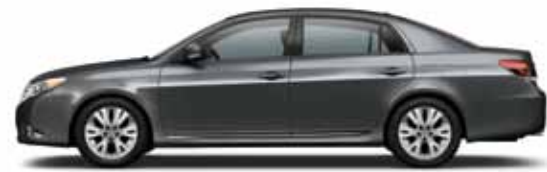
1G3 Magnetic Grey Metallic B