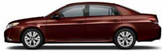
3R0 Sizzling Crimson Mica B