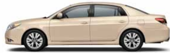
4T8 Sandy Beach Metallic A