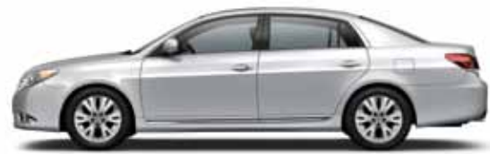
1F7 Classic Silver Metallic B