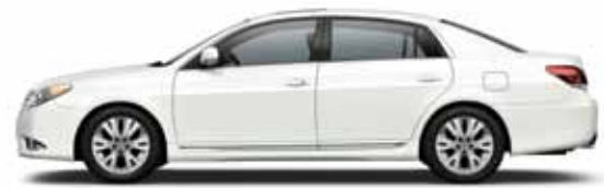
070 Blizzard Pearl A