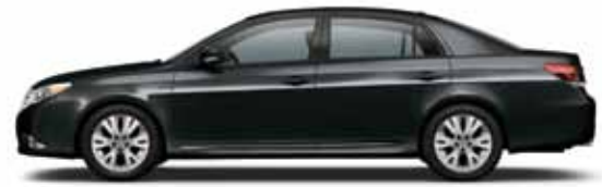
202 Black A