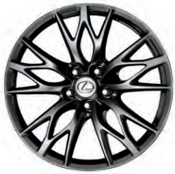
19-inch mesh type aluminum alloy wheels STANDARD