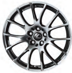
19-inch BBS forged aluminum alloy wheels OPTIONAL