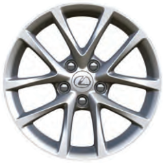
17-inch split-5-spoke alloy wheels STANDARD IS 250 AWD and IS 350 AWD IS 250 RWD