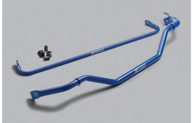
F-Sport sway bars