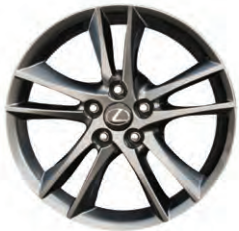
18-inch split-5-spoke alloy wheels STANDARD IS 350 RWD AVAILABLE IS 250 RWD A/T