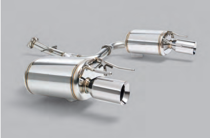
F-Sport performance exhaust system