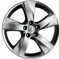
18-inch 5-spoke alloy wheels STANDARD ISC