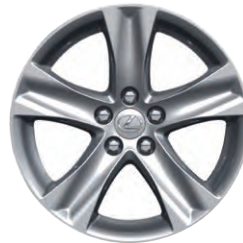
18-inch 5-spoke alloy wheels OPTIONAL IS 250 RWD M/T ISC Special Edition