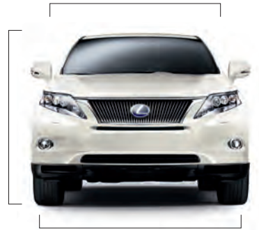
HEIGHT 1,720 mm/67.7 in