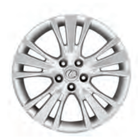
19-inch split-5-spoke alloy wheel AVAILABLE RX 450h