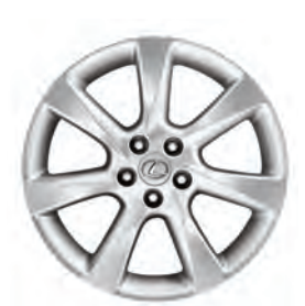
19-in 7-spoke alloy wheel AVAILABLE RX 350