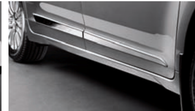
Chrome Accent Mouldings