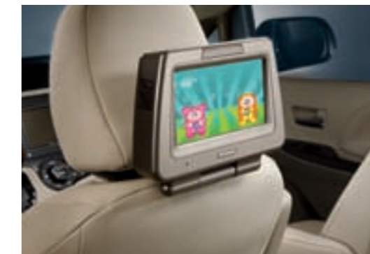
Rear Seat Entertainment System Keep your kids entertained and occupied on those long road trips.