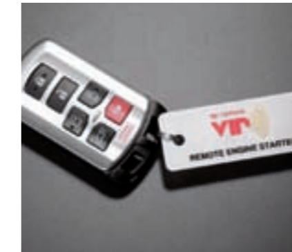
Remote Engine Starter Start your vehicle from as far as 80 feet away to cool or warm it before entry.