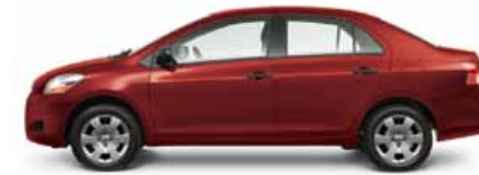
3R3 Barcelona Red Metallic