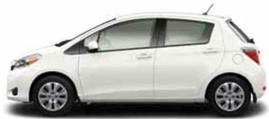
040 Alpine White (CE, LE)