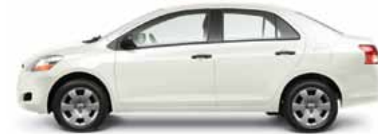
040 Alpine White