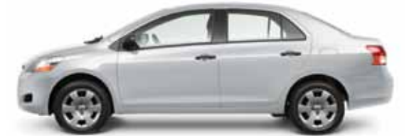
1E7 Silver Streak Mica