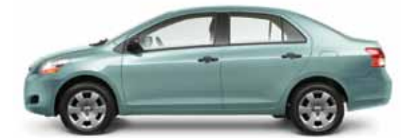
777 Jade Sea Metallic