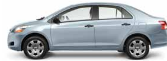
8N0 Zephyr Blue Metallic