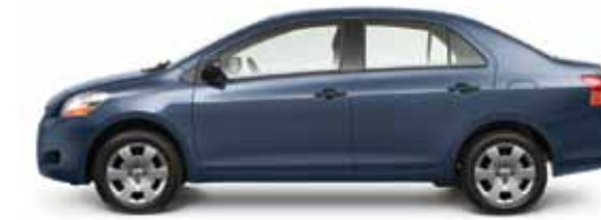
8R3 Pacific Blue Metallic