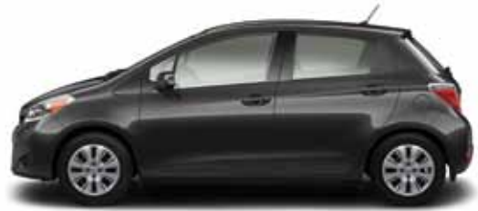
1G3 Magnetic Grey Metallic