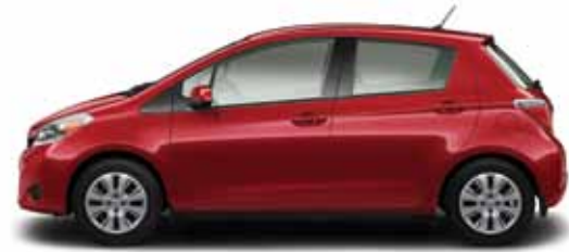
3P0 Absolutely Red