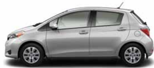
1F7 Classic Silver Metallic