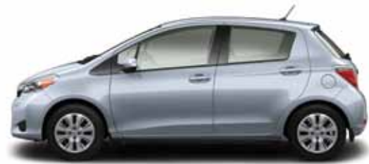
8S7 Wave Line Pearl (LE, SE)