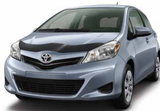
ACCESSORIES SHOWN Yaris Hatchback is shown with Hood Deflector.

Enhance the look and functionality of your new Yaris Hatchback by choosing from the following list of accessories: