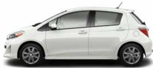
070 Blizzard Pearl (SE)