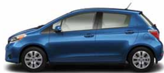
8T0 Blazing Blue Metallic (LE, SE)