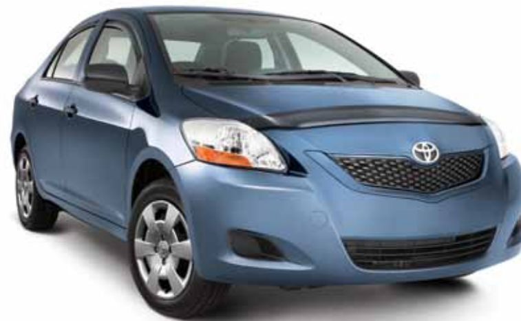
ACCESSORIES SHOWN Yaris is shown with Hood Deflector and Side Window Visors.

Personalize your Yaris 4-Door with interior and exterior accessories that suit your individual needs.