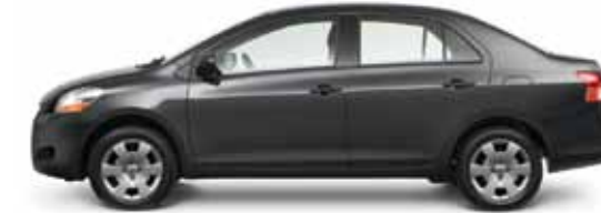
1E0 Flint Mica