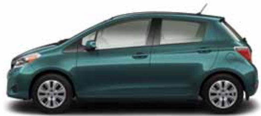
788 Lagoon Blue Mica (LE, SE)