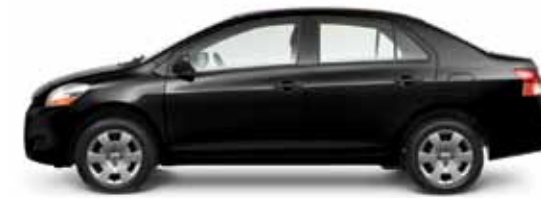
209 Black Sand Pearl