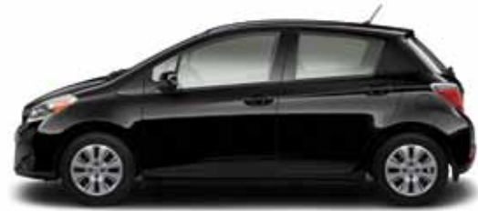
209 Black Sand Pearl