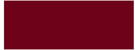
03R7 NOBLE SPINEL MICA