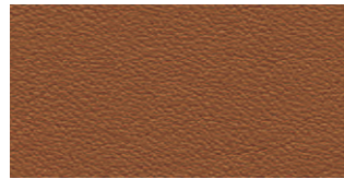
SADDLE TAN/BLACK LEATHER