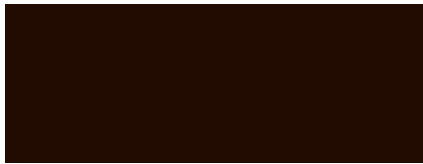
04U7 SATIN CASHMERE METALLIC