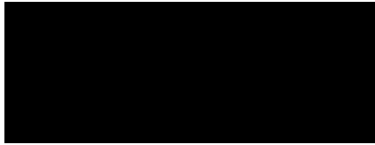
0202 BLACK ONYX