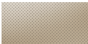
NULUXE - PERFORATED LEATHER - PERFORATED PREMIUM LEATHER - PERFORATED