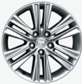
17-inch split 6-spoke alloy wheels ES 350 standard