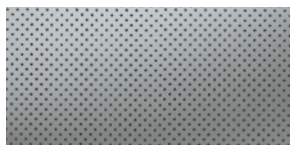
NULUXE - PERFORATED LEATHER - PERFORATED PREMIUM LEATHER - PERFORATED