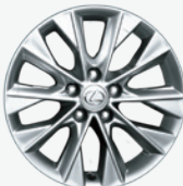
17-inch split 5-spoke alloy wheels ES 300h standard