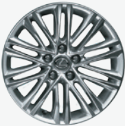
18-inch split 10-spoke alloy wheels ES 350 optional