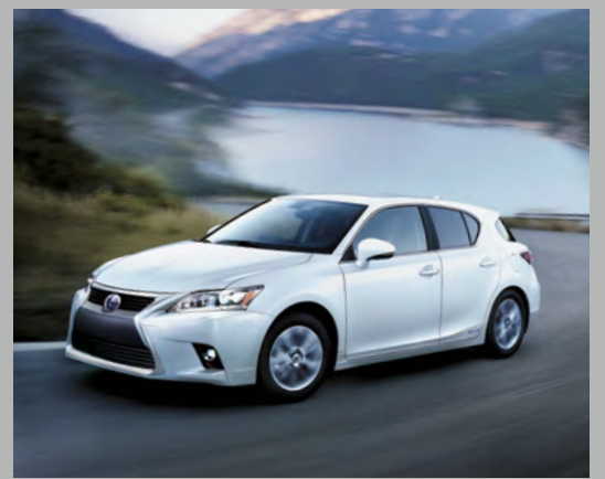
VEHICLE STABILITY CONTROL (VSC) This system constantly monitors your contact with the road. It instantly detects any sideslip of the wheels and helps to control it by modulating engine power and selectively applying individual brakes. It works alongside the already excellent Anti-lock Brake (ABS) and Traction Control (TRAC) systems.