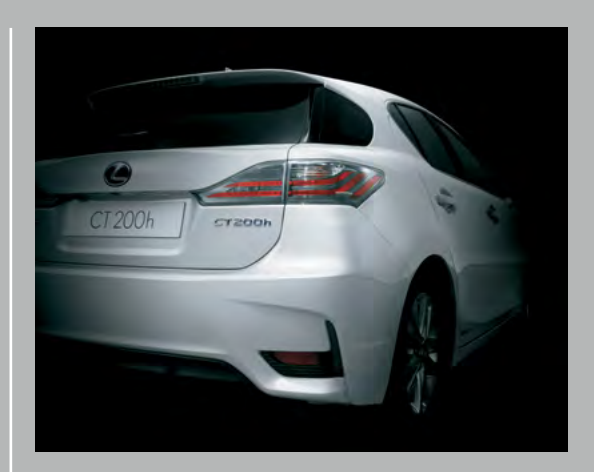
BACKUP CAMERA New for 2017, the CT offers a standard backup camera.<sup>20</sup> Anticipating your every need, the view is conveniently displayed in the rear view mirror the moment you place the vehicle into reverse.