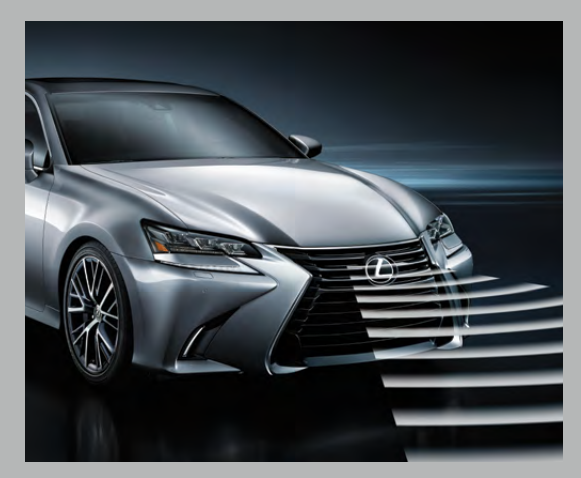
LEXUS SAFETY SYSTEM+ Designed to help keep you protected, Lexus Safety System+ provides a host of driverassist features like Pre-collision System<sup>8</sup> which warns you of potential impact and readies the brakes for evasive manoeuvres. Lane Departure Alert<sup>3</sup> is designed to warn a driver when the vehicle begins moving out of its lane without signaling intent, while Automatic High Beam<sup>15</sup> ensures optimum nighttime visibility. Dynamic Radar Cruise Control<sup>7</sup> helps you maintain a safe distance from other vehicles by automatically adjusting throttle or braking when cars ahead slow down.

The most valuable insurance comes built-in with a comprehensive set of safety features that includes Vehicle Stability Control (VSC), Anti-lock Brake System (ABS), Traction Control (TRAC), Electronic Brake-force Distribution (EBD), and Brake Assist (BA).<sup>12</sup> And for even greater confidence, the GS comes equipped with Lexus Safety System+.