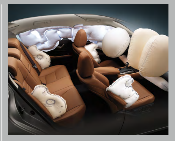
RAISING THE BARRIER IN EVERY DIRECTION Cover every angle with 10 standard airbags, 16 including driver and passenger knee, driver and passenger airbag Supplemental Restraint System (SRS)<sup>10</sup> front seat mounted side, front and rear side curtain, and rear seat side.