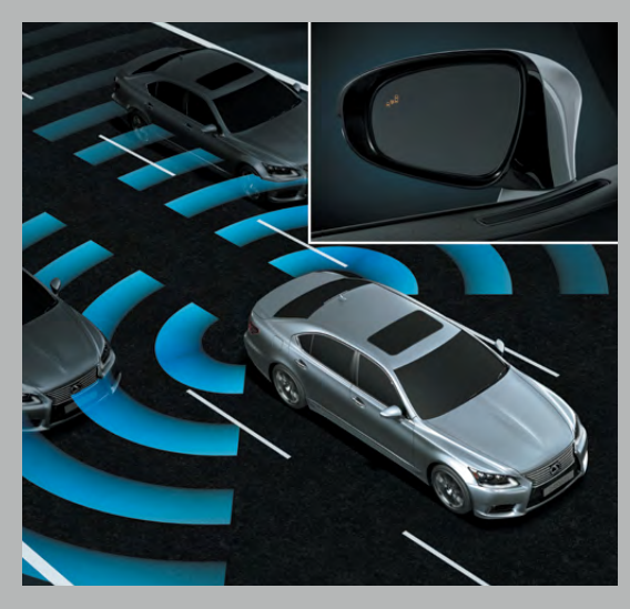
BLIND SPOT MONITOR The 2017 LS offers the Blind Spot Monitor System, which uses radar sensors to help alert you to vehicles in your blind spots, allowing you to keep your focus on the road ahead.