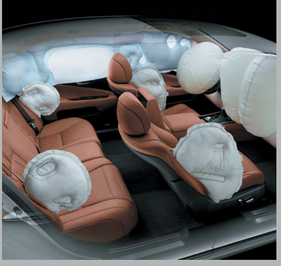
10-AIRBAG SYSTEM Standard airbags include driver and passenger knee airbags, front seat-mounted side airbags, front and rear side-curtain airbags and rear seat side airbags.<sup>19</sup> In addition, front seats are designed to help decrease the severity of whiplash-type injuries in certain rear collisions.