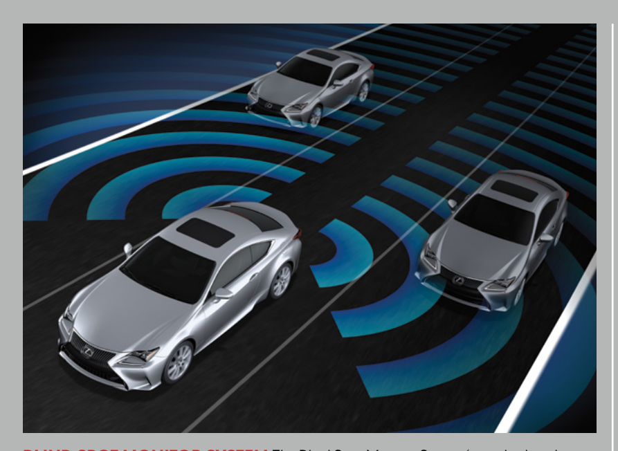
BLIND SPOT MONITOR SYSTEM The Blind Spot Monitor System, standard on the RC 350 and available on the RC 300, keeps an eye where yours can't go. The system's detection range of vehicles approaching from behind at high speed has been extended, giving you a better view of what's behind as you power ahead.

As with every other part of the high-performance RC, no corners were cut when it comes to your safety, supported by an array of features.