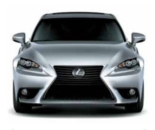
WIDTH 1,810 mm (71.3 in)