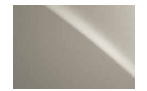
ATOMIC SILVER 01J7