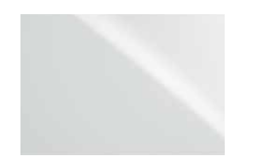
ULTRA WHITE 0083