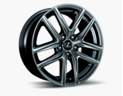
18-inch double parallel 5-spoke alloy wheels Available F SPORT