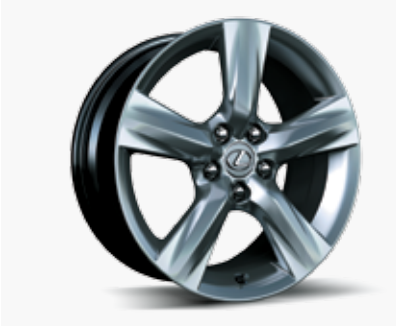
18-inch 5-spoke alloy wheels Available IS 350