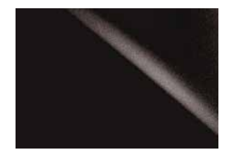
STARLIGHT BLACK MICA 0217