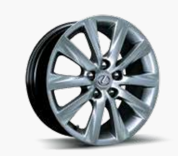
17-inch 10-spoke alloy wheels Standard IS 250 and IS 350