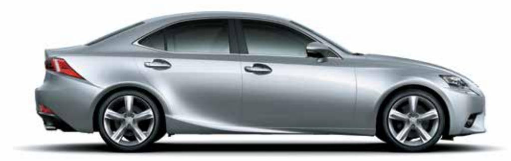
HEIGHT 1,430 mm (56.3 in)