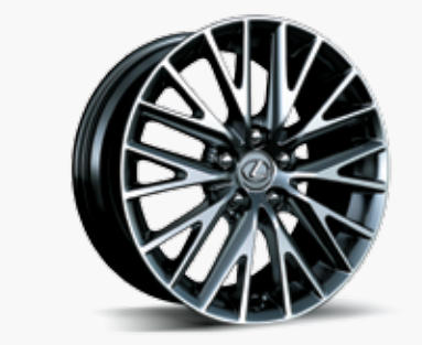
18-inch split 10-spoke alloy wheels Available IS 250