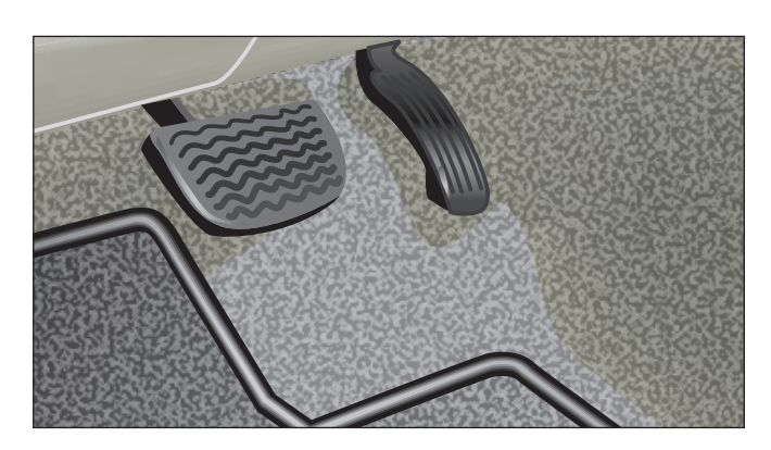
Check the pedal operation by fully depressing the pedal to ensure the floor mat does not intefere with it. When testing, make sure the vehicle is off, in 'Park' (for automatic transmission models) and the parking brake is on.